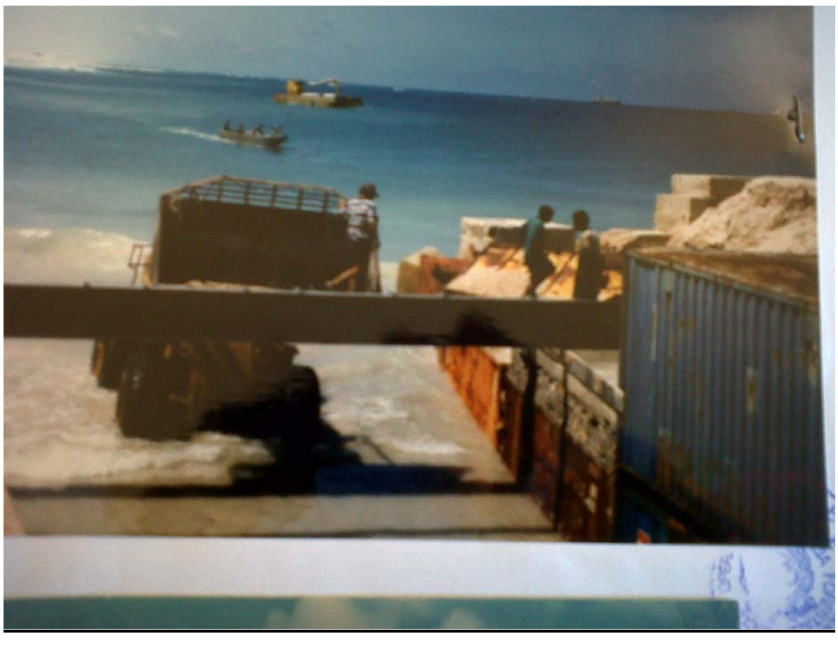
Page 27 of 36